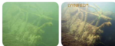
SUB SEA – LYYN gives you a clearer vision

LYYN AB Ideon Science Park SE-223 70 Lund, Sweden Phone: +46 46 286 57 90 info@lyyn.com www.lyyn.com