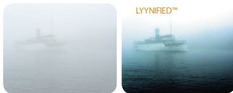
FOG & HAZE – LYYN gives you a clearer vision

As LYYN can be integrated into existing systems as a "turbo charger", no expensive upgrade of complete systems is required.