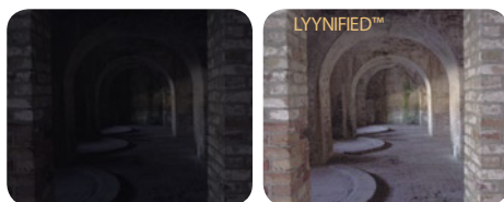
LOW LIGHT – LYYN gives you a clearer vision